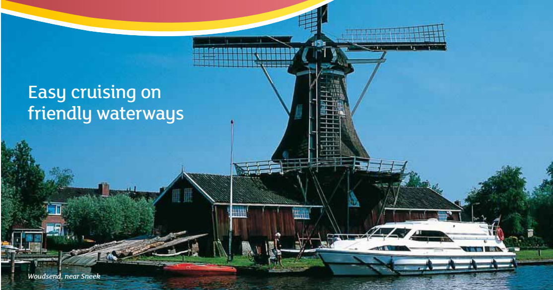
Woudsend, near Sneek