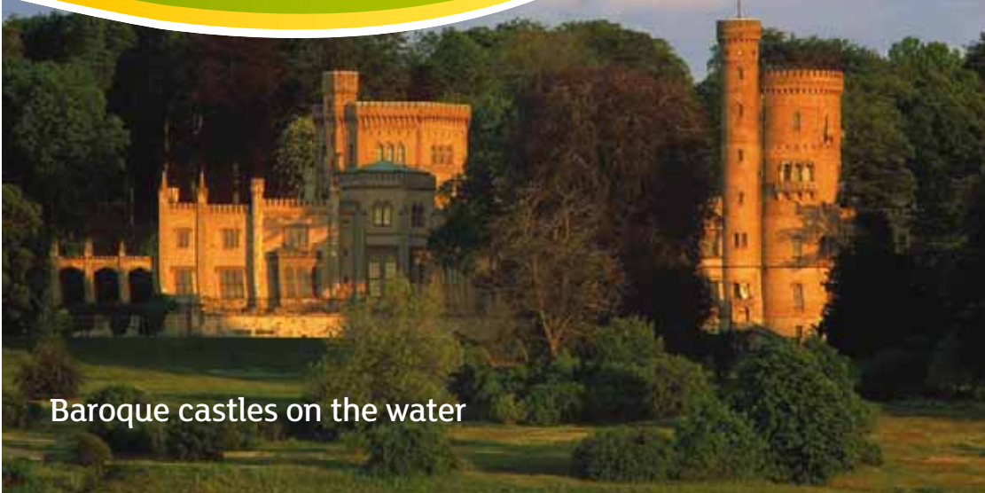
Baroque castles on the water