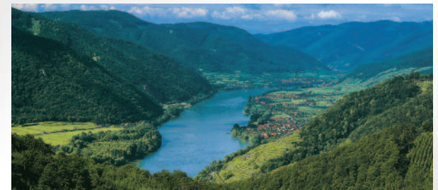
Wachau Valley, Austria

Day 12, BAMBERG. Enjoy your breakfast as you cruise along and marvel at the engineering feat of the Main-Danube Canal which straddles the Franconian Alps via 16 locks. Then arrive in Bamberg and enjoy a walking tour of this medieval gem, which