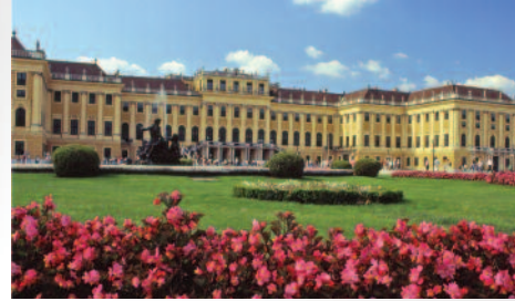
Schönbrunn Palace, Vienna