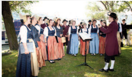
Folklore entertainers, Wachau Valley

Combine the highlights of the legendary Main and Danube with the picturesque Rhine and Mosel and experience a voyage of cultural and scenic diversity through the six countries of Hungary, Slovakia, Austria, Germany, Luxembourg and France. Start your European vacation with two grand old capitals, vibrant Budapest and magnificent Vienna. Journey on the Main-Danube Canal across the Continental Divide, and visit charming towns with beautiful vistas. Cruise through the lush and scenic Mosel Valley, famous for its many historical castles and the steepest vineyards in the world, and be close to the heart of the people living in the medieval cities along the Rhine and Main river. Conclude your European vacation in Paris, the City of Lights.