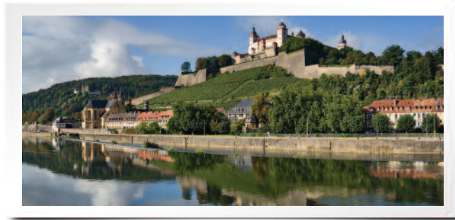
Marienberg Fortress, Würzburg