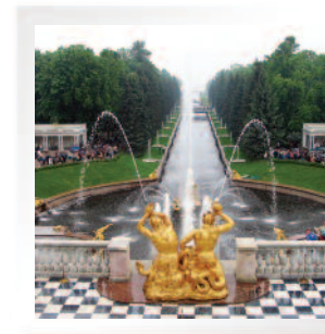
Fountain at Catherine's Palace

Day 6, UGLICH. Located on the banks of the Volga, Uglich was founded by merchants in 1148. Rich in history, Uglich is home to some of Russia's most beautiful churches and cathedrals, and you'll see a sampling during your city tour. The most noteworthy include the Transfiguration Cathedral and the magnificent