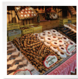
Sample German pastries