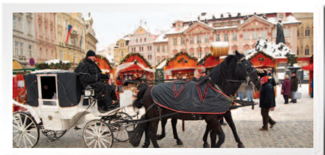
Enjoy a carriage ride through Prague

Day 11, PRAGUE. Bid farewell to Prague and transfer to the airport for your onward flight. (B)