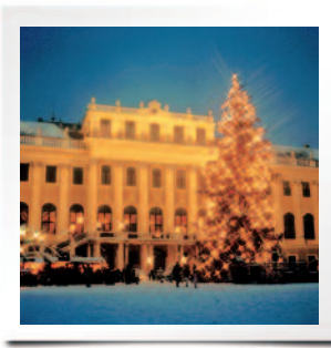
Schöbrunn Palace, Vienna

Day 5, VIENNA. Savor the Baroque elegance of romantic Vienna during your morning guided sightseeing tour, including the lavish Hofburg Palace, the impressive Vienna Opera House, the majestic Ringstrasse, elegant Kärtnerstrasse and awe-inspiring St. Stephen's Cathedral. The remainder of the day is at your leisure. Perhaps, return to the Christmas Markets to sample a mug of glühwein (warm spiced wine) and