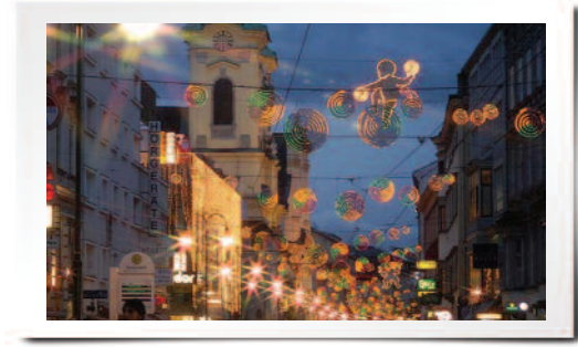
Decorated street in Linz, Austria