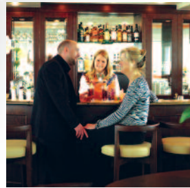
Enjoy the cozy bar in the Main Lounge