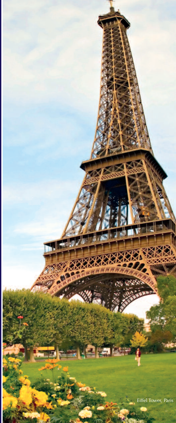
Eiffel Tower, Paris