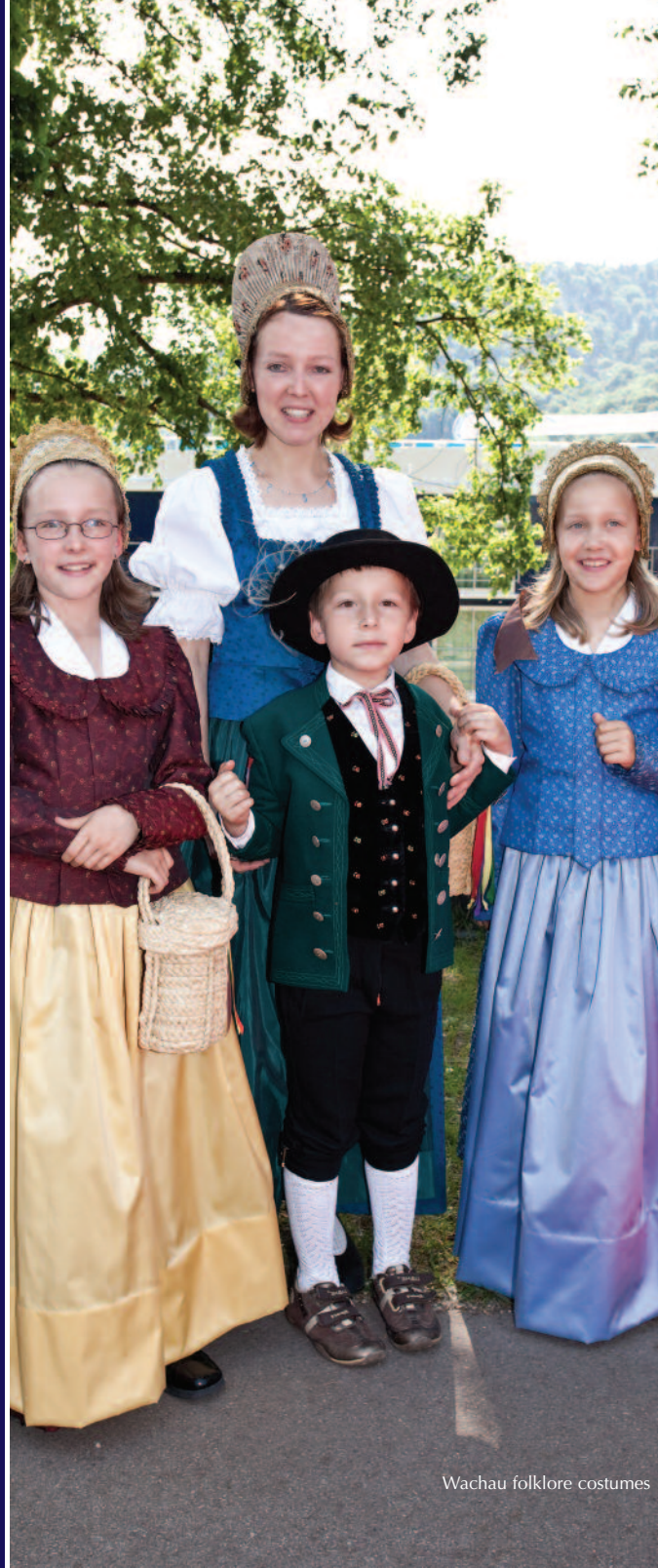
Wachau folklore costumes