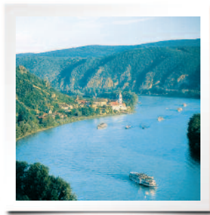
Wachau Valley, Austria