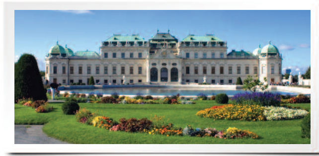
Schloss Belvedere, Vienna